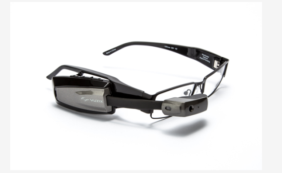
Vuzix M100 800 EUR