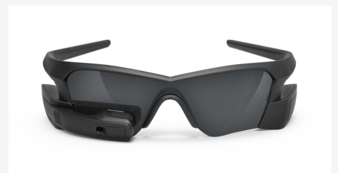
Recon Jet 550 EUR