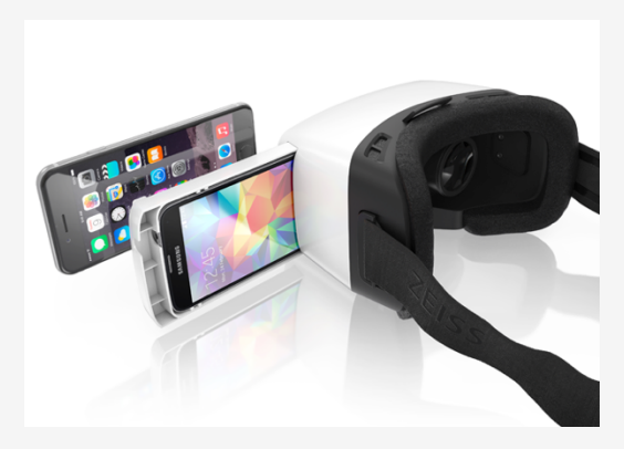
Zeiss Z One