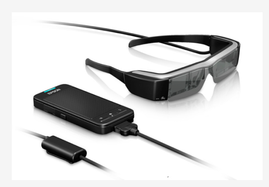
Epson Moverio 600 EUR